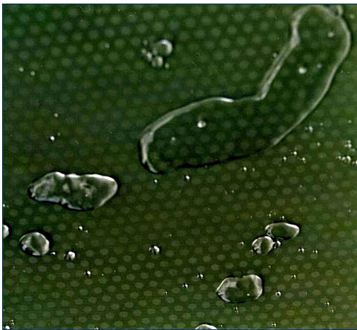
Fig. 3a: correct

If the screen is not soiled or damaged and the coating is in perfect condition, the water will break up into beads, rolling off the surface (fig. 3a) without seeping into the pores of the screen and the inside of the element. The element has passed the water repellence test and can be re-installed as detailed under item 7. If the screen is dirty, the water will not form beads (fig. 3b). It will adhere to the screen and seep into the pores. The element has not passed the water repellence test and must be cleaned and dried as detailed under item 5. If water penetration is due not to soiling but to mechanical damage such as holes, cuts or areas where the coating is scraped away, please see item 6. If, after repeated cleaning the element continues to fail the water repellence test or if the screen is so badly damaged that it cannot be repaired as detailed under item 6, the element must be replaced.