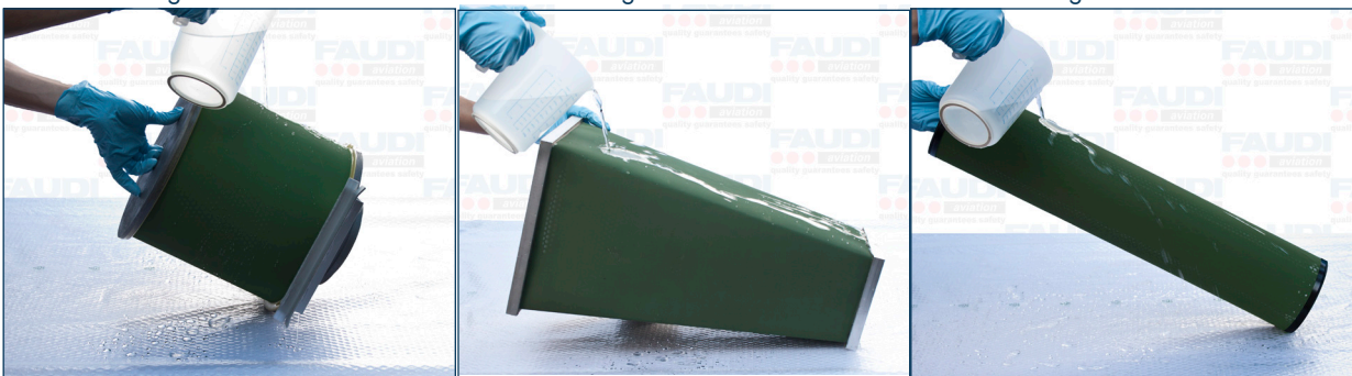
Fig. 2a: wrong