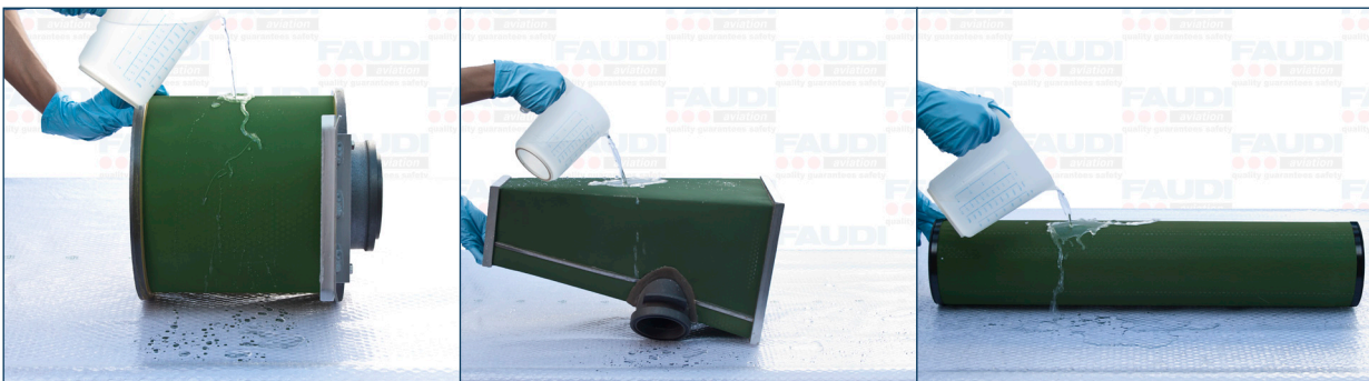
Fig. 1a: correct

Hold the element as shown in figures 1a-c and slowly pour clean tap water on the coated screen from a height of approx. 1" (2,5 cm). Do not spray the water. Avoid making gushes or jets of water. Do not pour the water from more than 2" (5 cm) above the element. Ensure that the water can run freely over the surface of the element. Rotate the element so that water can flow over the entire screen surface and every portion of the screen comes in contact with the water. Hold the upper side of the Teflon® coated screen in horizontal position to ensure that the water does not cascade on to the folded-over edges of the end caps where the screen is held. If the water were to penetrate at this point, this would give a false test result. We recommend testing the separator element according to JIG 1, A5.2.4: "[...] The separator(s) needs to be completely wet with aviation fuel to perform a valid test [...]."